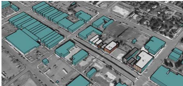
3D Planning Model